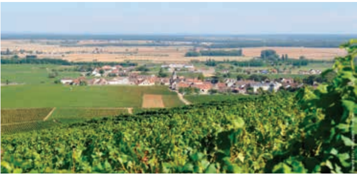
View from Jean Grivot property in the Côte d’Or.